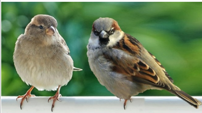
Male and female house sparrows look very different: the female is on the left and the male is on the right.