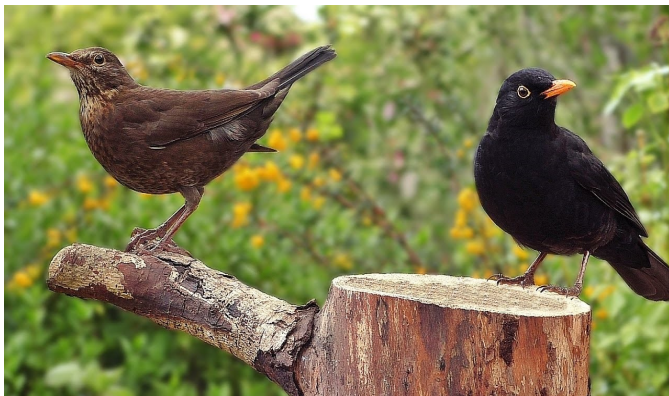
The male blackbird on the right, has a bright yellow beak while the female on the left is brown with speckling on the feathers, especially on the chest.

Then there are the sparrows. Brown birds are notoriously tricky to identify as there are lots of different ones, but if you know some of the key characteristics, the job of identifying them will be much easier. The most common sparrow in gardens is the house sparrow, but here again, male and female birds are different, just to confuse the novice ornithologist. Look at the photos below and familiarise yourself with the differences between males and females of these species.