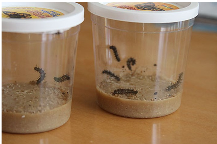
Above: the caterpillars feeding in the tubs.

Did you know? Caterpillars, while in their cocoons, turn to a liquid and the liquid reforms into a butterfly?