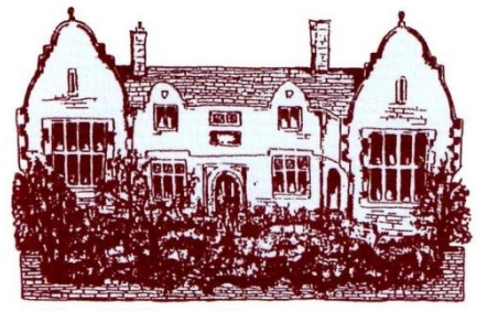
The William Alvey CE School